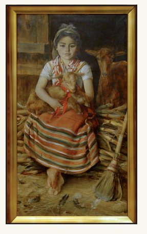
0.2 Obdulio Miralles Girl with goatling